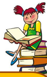
Photo Consent form

New GDPR regulations mean that we need to ask you to re-sign your photo permission form for your child(ren). A form has been issued on parentmail which we would be grateful if you would complete asap. Thank you.